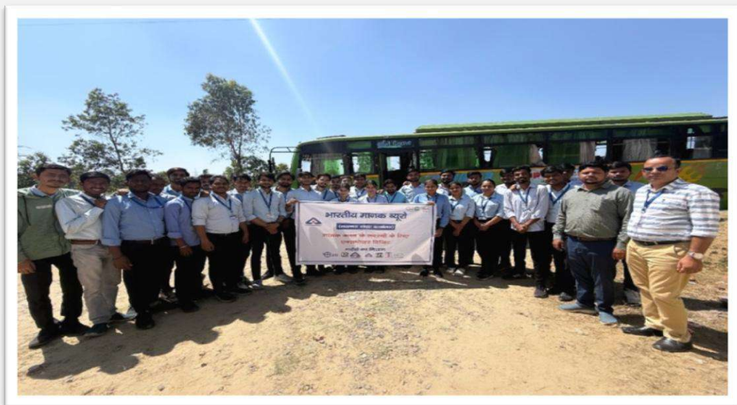
Industrial Visit at Balram Bottlers, Lucknow